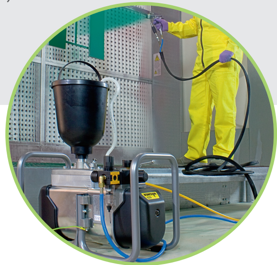
GM 4700AC Cobra 40-10 Hopper 5L Spray Pack Part # 2342248

Cobra® is a high-pressure double diaphragm pump suitable for Airless and AirCoat applications up to 250 bar/3,625 psi. Cobra® is the first high-pressure pneumatic pump without packings. The absence of friction in the fluid section and the minimum shear make it perfect for any kind of material including the most critical ones such as reactive paints (UV paints, isocyanate's, acrylics) or highly abrasive materials. The pump works with extremely low pulsation and creates a uniform paint flow, achieving a perfect spray pattern and superb surface quality.